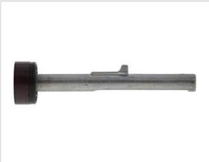
Eurocode 014641 Magnetic washer pin guide for P40 / P800