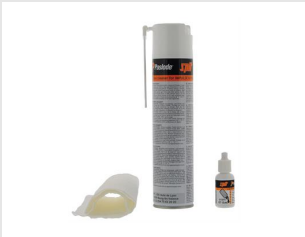
Eurocode 013690 Impulse & Pulsa Cleaning Kit