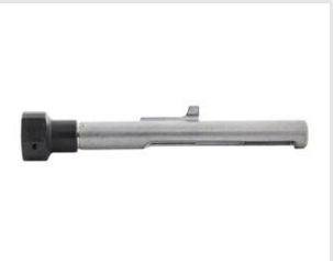
Eurocode 014642 Flat Magnetic Pin Guide for P40 / P800