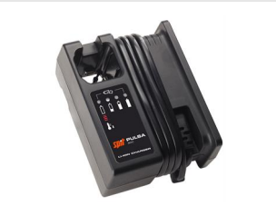
Eurocode 018482 EU battery charger for P40 / P800 tool