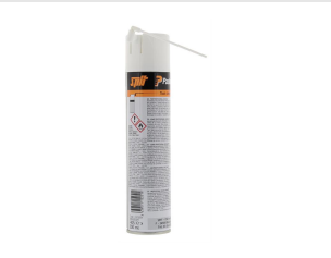
Eurocode 115251 Impulse Cleaner 300ml