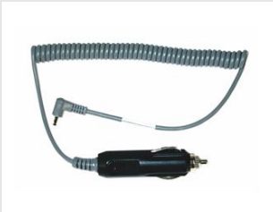
Eurocode 900507 In-car Charger Adaptor