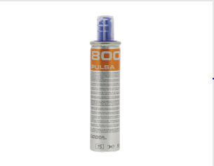
Eurocode 011773 Blister pack of P40 / 800 fuel cells