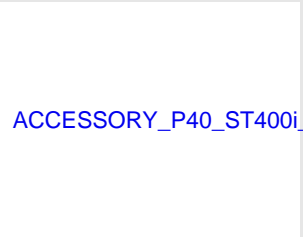
Eurocode 019336 Battery for P40 / P800 / ST400