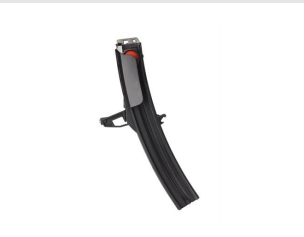
Eurocode 019683 50-pin magazine for P40 / P800