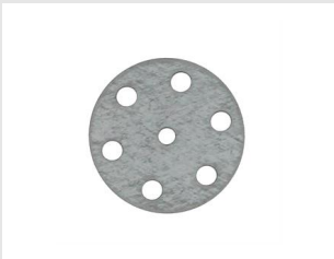
Eurocode 011204 Steel Washer 25mm